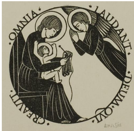
Eric Gill, 1916

Those wishing to enjoy the Postlude are encouraged to remain in their pews. We ask that others kindly move to the fellowship hall for conversation and socializing.